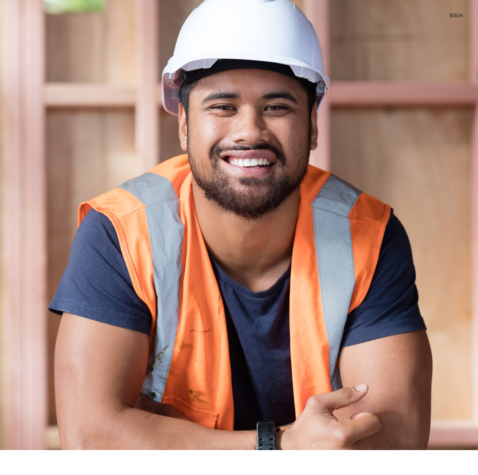
KiwiSaver Annual Report 2021